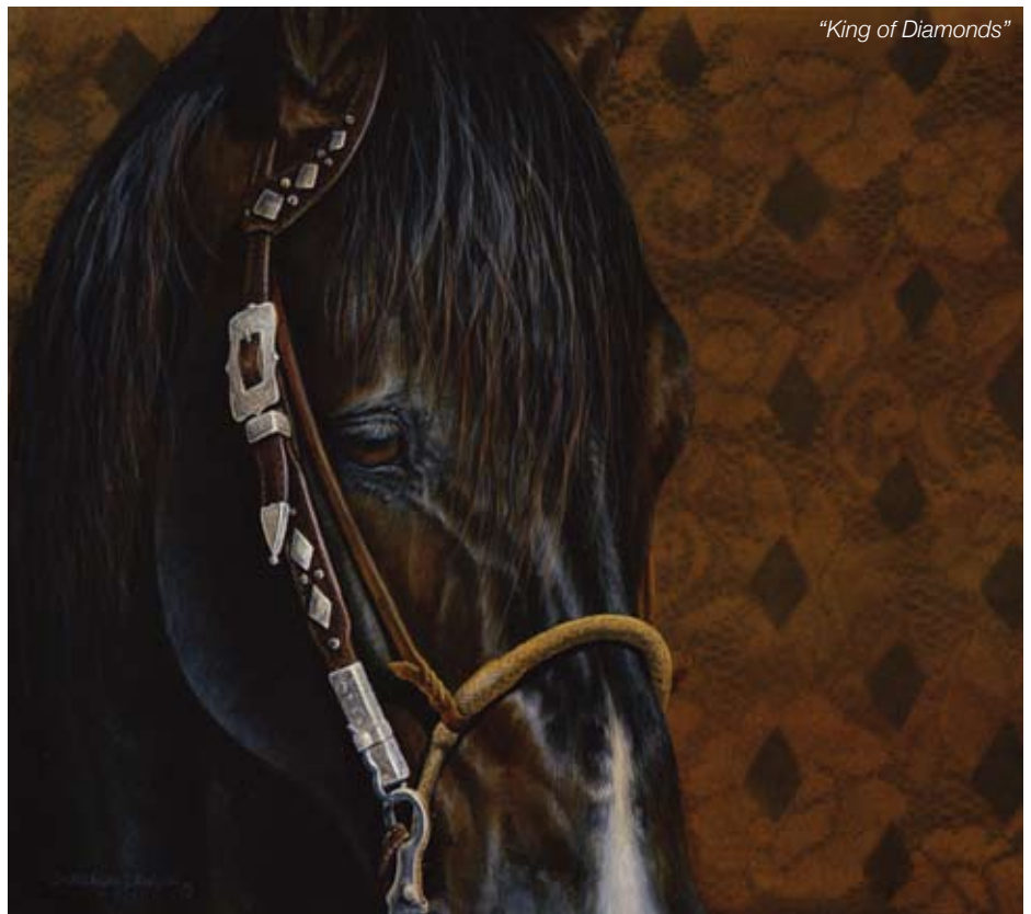
"King of Diamonds"

"Wishing you all the best for the New Year from the staff at the AQHA"