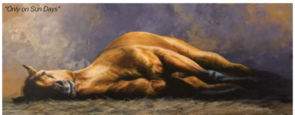
"Only on Sun Days"

My choice of paint is a medium viscosity acrylic and I use Chromacolor brand paint. My palette is limited to only 5 colours - Magenta Deep, Cadmium Yellow Deep, Phthaloocyanine Blue, Paynes Grey, Titanium White. From these colours I can mix every other color I will ever need. Going back to the preliminary sketch, I will now transfer the sketch by using tracing paper to the prepped board in conjunction with a homemade chalk transfer paper. This allows me to see through the paper, knowing where